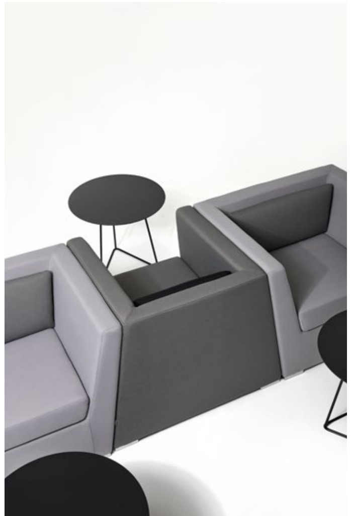
Era CSE11 - CSE13