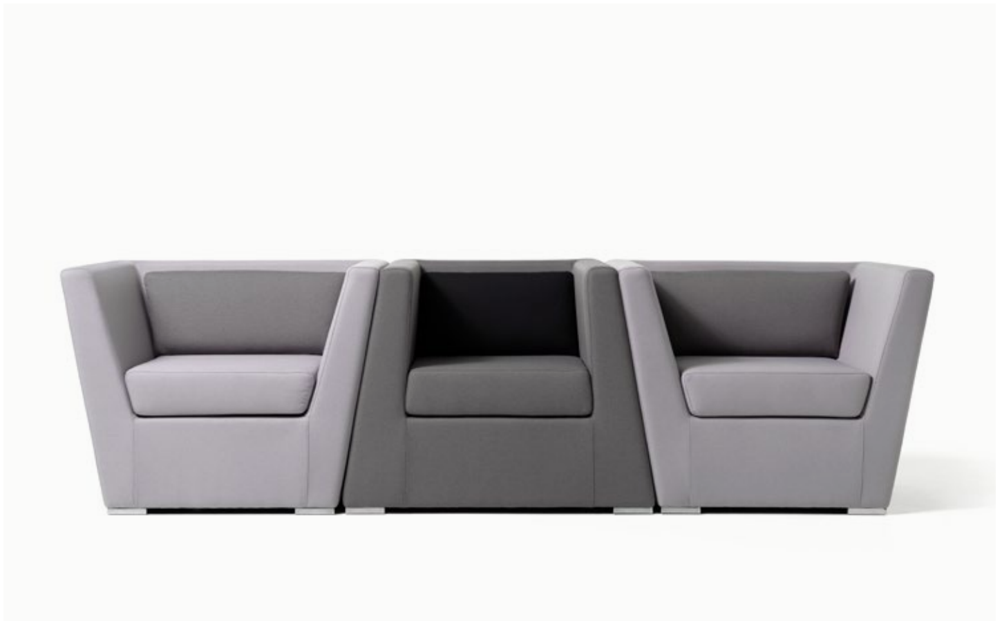
Era CSE11 - CSE13

The DOUBLE system sets the whole concept of modularity in a new perspective. Double armchairs, characterized by their distinctive linear design, come in two versions: one open, flaring outwards, the other closed and more contained. There is also a sofa that interlocks with the closed armchair. If combined, these pieces can create a dynamic game of diagonals that runs from the feet right up to the armrests.